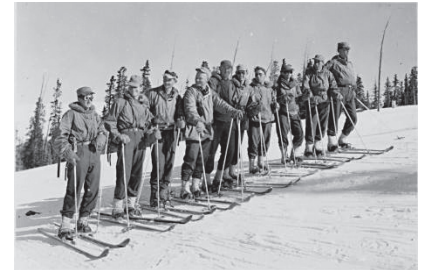
10th Mountain Division